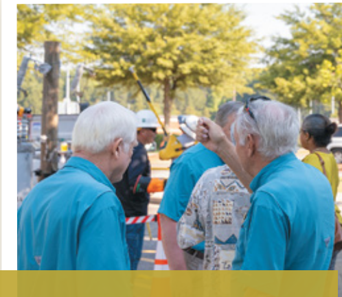
The 2024 Annual Meeting was a hybrid event where members could choose to drive through or attend the business meeting in person. This format gave members a chance to meet and talk face-to-face with the co-op's directors (in the blue shirts).